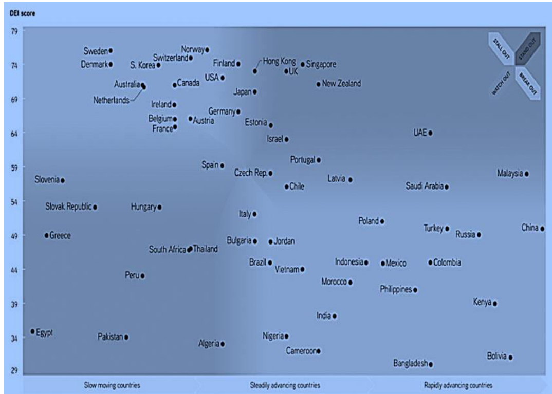
Fig 2: DIE Score Showing India in Steadily Advancing Countries

Government development index based on the survey of United Nations, India stands at 107th position as compared to 125th position in 2012. Similarly index report states the improvement in e-Participation with 27th position in 2016, as compared to 75th position in 2012.